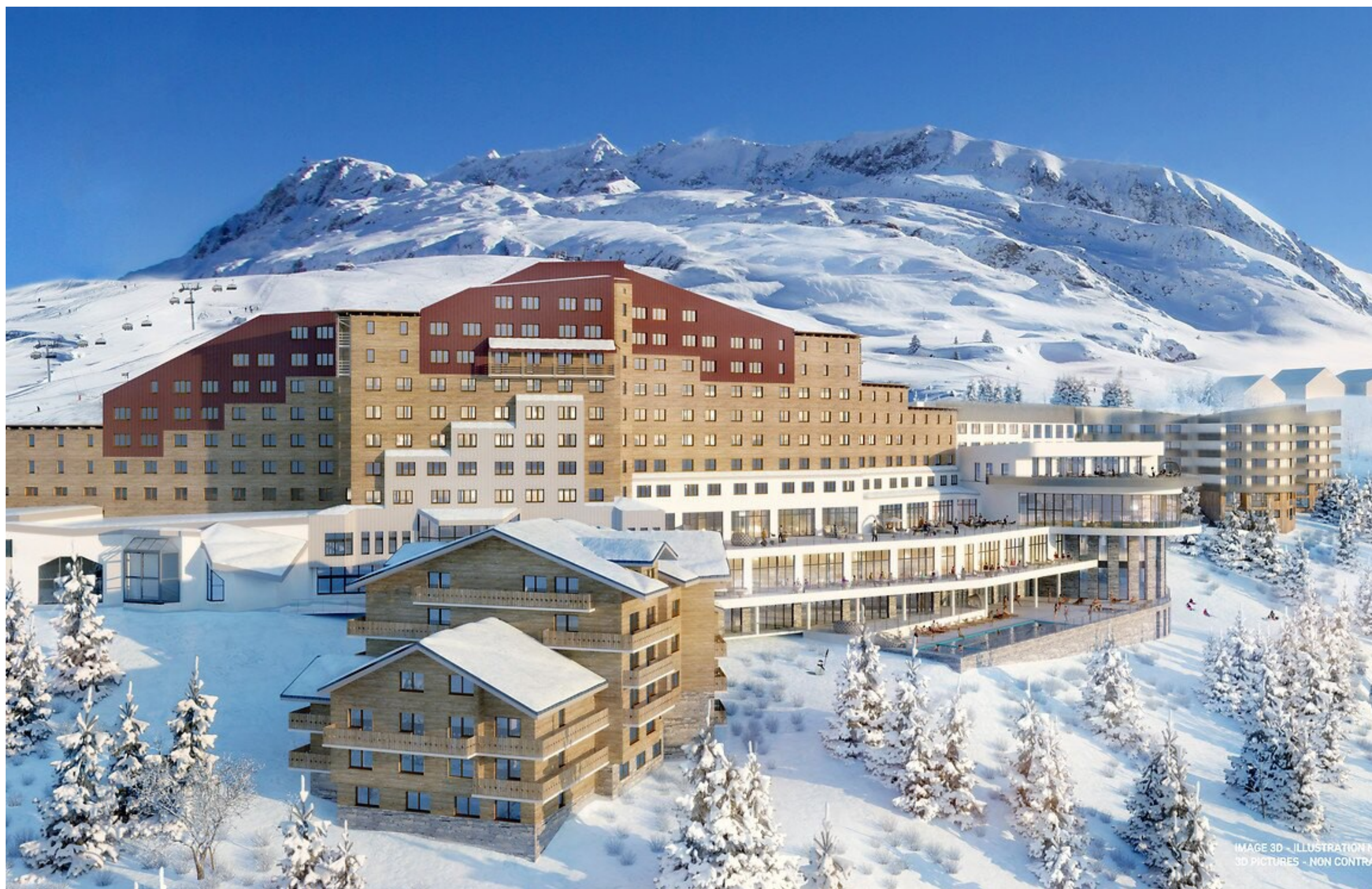
IMAGE 3D - ILLUSTRATION 3D PICTURES - NON CONTRACTUAL